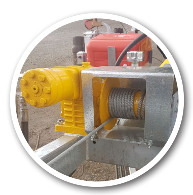
Heavy Duty Winch To keep the auger safe at heights