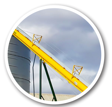
Solid Top Drive Shaft With Bearings