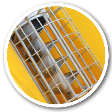
Cupped Edge Flighting Carries grain rather than dragging it.