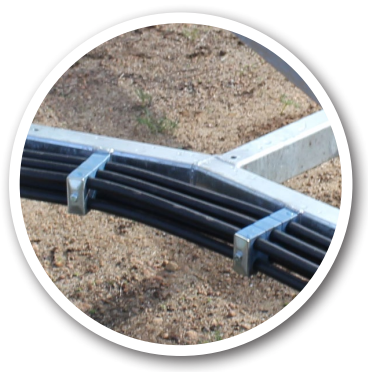
All Hydraulic Hoses Clamped In Saddles-Not zip tied