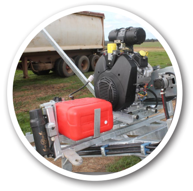
Electric Clutch Optional Less wear on belts