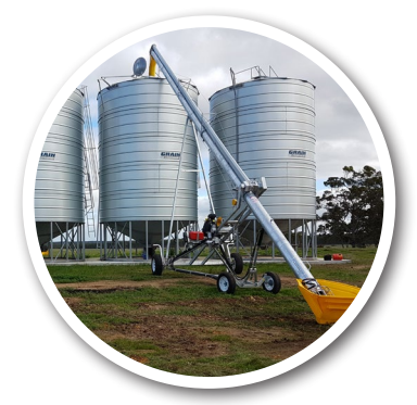
Optional Fully Hot Dipped Galvanized Tube and Frame