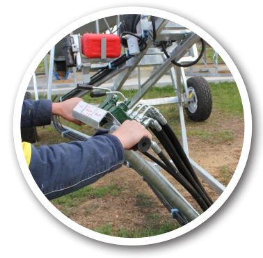
Safe & Easy To Use Mover Controls