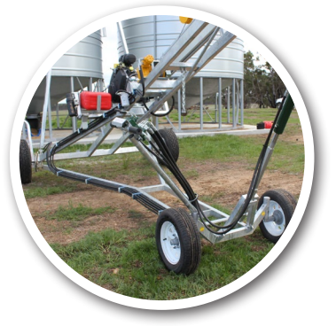
Heavy Duty Chassis & Wheel Frame