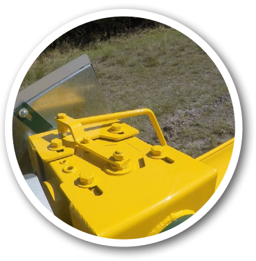
Reversible Gearbox To easily clean when changing varieties