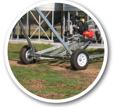
2 Wheel Drive For extra traction on rough terrain