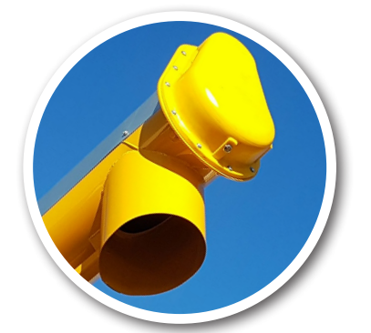
Oil Bath Final Drive Less maintenance costs